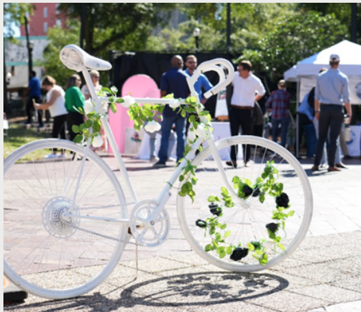
Bicycles painted all white are commonly used to honor cyclists that have been lost in traffic crashes.