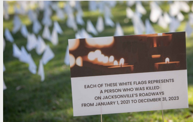
Visuals at the event denoted the high number of traffic fatalities in Jacksonville over the past three years.