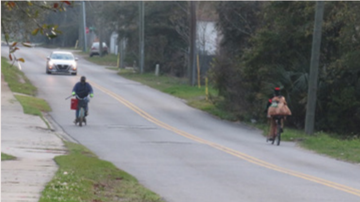
Separating vehicles with off-roadway nonmotorized facilities like shared-use paths (trails) or protected bicycle lanes while also reducing vehicle speeds will create a safer environment for residents that ride bikes and walk.