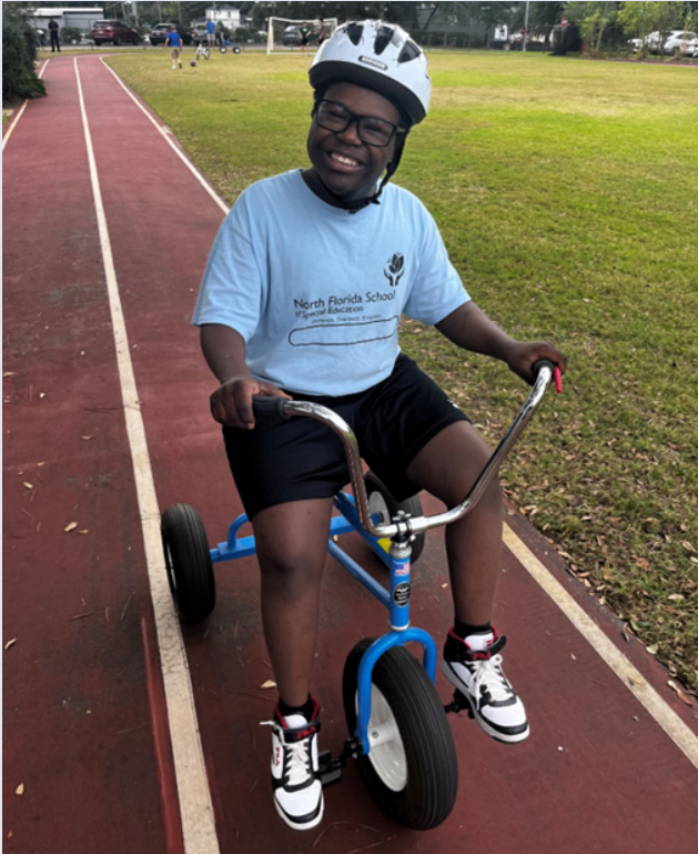
A student at NFSSE learns valuable bicycle safety skills through their bike program.

North Florida School of Special Education was founded in 1992 by a group of parents who recognized the need for better educational opportunities for children with intellectual and developmental differences.