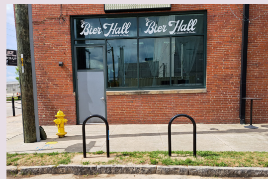
JaxRax at Intuition Ale Works on Bay Street

Through the JaxRax program, businesses and community members can request a bicycle rack to be installed within the public right-of-way throughout Jacksonville. Learn more about our program by visiting our website: Jacksonville.gov/pedbike