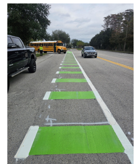
Images and layout of the new green bicycle lanes along RG Skinner Parkway.

The City of Jacksonville has completed the construction of new green bicycle lanes along RG Skinner Parkway in a significant step towards improving urban mobility. This project not only introduces vibrant green markings to delineate bike paths but also includes a critical realignment of existing curbs. Previously, these curbs protruded into the bike lanes, forcing cyclists into vehicular traffic for short stretches, making the area less comfortable for both drivers and cyclists. The new layout ensures a continuous, safe, and comfortable passage for nonmotorized users, enhancing the overall cycling experience in the area.