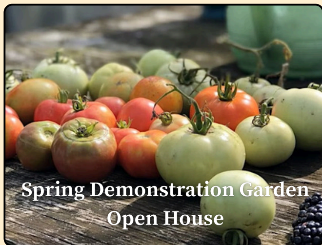
Spring Demonstration Garden Open House

Tour our demonstration garden, ask questions, and learn about what we grow in the spring, as well as different growing methods. Check out our new garden mural! We will be demonstrating how to scout for insects. Also, you will have the opportunity to take home a small packet of seeds for your garden!