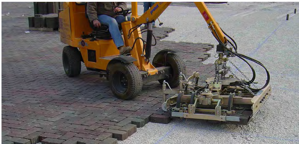
Figure 5. Mechanical installation of concrete paving units for PICP.

Most PICP projects are machine-installed to accelerate construction time over manual installation. Figure 5 illustrates a machine that lifts and places about a square yard (m 2 ) of concrete pavers in their final laying pattern. The units are placed on the screeded bedding layer of aggregate, the joints are filled with aggregate, and the paver surface is swept clean and compacted.