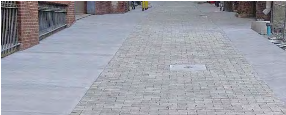
Figure 3. PICP used to reduce combined sewer overflows in Richmond, VA.