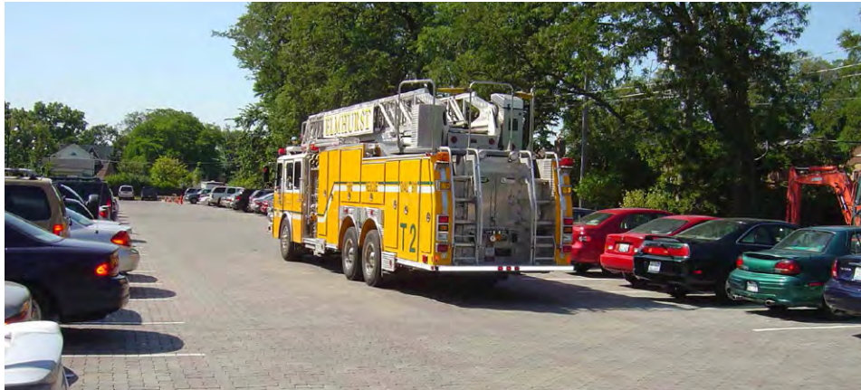
Figure 2. Parking lot in Elmhurst, IL.

PICP is used for walkways, driveways, parking lots, alleys, low-speed roads, and road shoulders. Figures 2, 3, and 4 illustrate vehicular applications. PICP is intended for areas with posted vehicle speeds no greater than 35 mph (50 kph). PICP is generally used in areas exposed to less than 1 million 80 kN lifetime equivalent single axle loads (ESALs; or Caltrans Traffic Index < 9). These applications use unstabilized open-graded aggregates. Open-graded bases stabilized with cement or asphalt, or the use of pervious concrete or porous asphalt bases, can provide higher lifetime ESALs; and accommodate heavier load applications. PICP has seen limited use in heavy load applications with permeable asphalt stabilized bases (Knapton 2003, Sieglén 2004). Design guidance for heavy loads can be found in overseas sources (Knapton 2007, 2012).