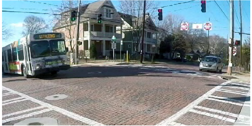
Figure 4. PICP streets in Atlanta, GA.

PICP should not be used in areas subject to loading/unloading or storage of hazardous materials. It is generally not placed in areas with high depth to seasonal water tables (i.e., less than 2 ft or 0.6 m), although it has been used in coastal areas with sandy soil subgrades in Maryland, Virginia, South Carolina, and Georgia. Like all permeable pavements, PICP should not be used on extremely dirty sites where there is uncontrolled waterborne sediment or windborne dust that can rapidly clog the surface.