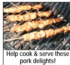
Help cook & serve these pork delights!

Munch Wagon helpers will help cook and serve the popular Pigs-On-A-Stick. The Duval County 4-H Foundation will be staffing a booth in the Agricultural Building to sell 4-H items & tickets. What a way to build friendships and teamwork! Come join us for a good time and to help raise much needed funds for 4-H activities and opportunities.