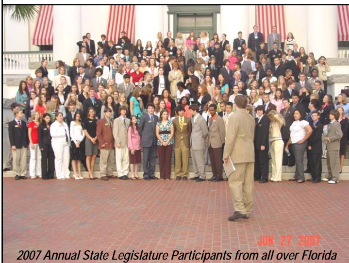
2007 Annual State Legislature Participants from all over Florida