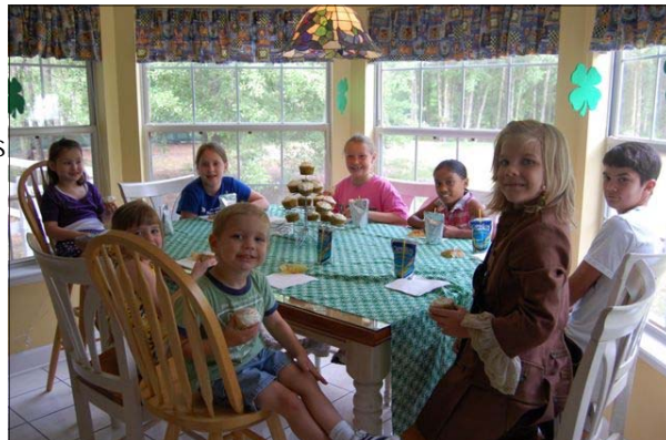
Rabbitters end of year party

The Rabbiteers 4-H club concluded the 4H year by having a bunny costume party. We had everything from a pink ballerina to a pirate. It was a lot of fun and each participant received an award. We also made bunny picture frames and enjoyed cupcakes.