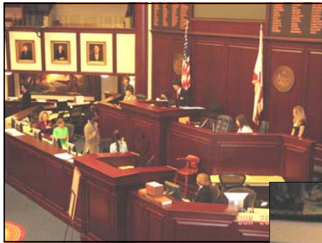
House of Representatives